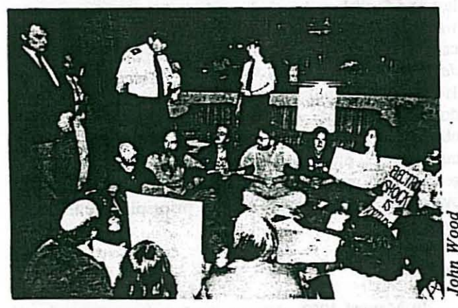
Demonstrators protesting the annual meeting of the American Psychiatric Association (APA) conference in Toronto, Canada, 1982.

psychiatric crimes as forced treatment of inmates with brain-damaging drugs, electroshock, and psychosurgery. A large crowd of supporters, police, hotel security, reporters, and smirking psychiatrists gathered around the silent group. After an hour and a half, supporters were forced to leave the lobby, and the members of the vigil were dragged and carried to waiting police vans. The demonstrators came from all parts of North America to attend the 10th International Conference on Human Rights and Psychiatric Oppression being held simultaneously with the APA convention in Toronto.